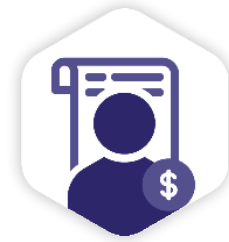
Client Payroll Manager